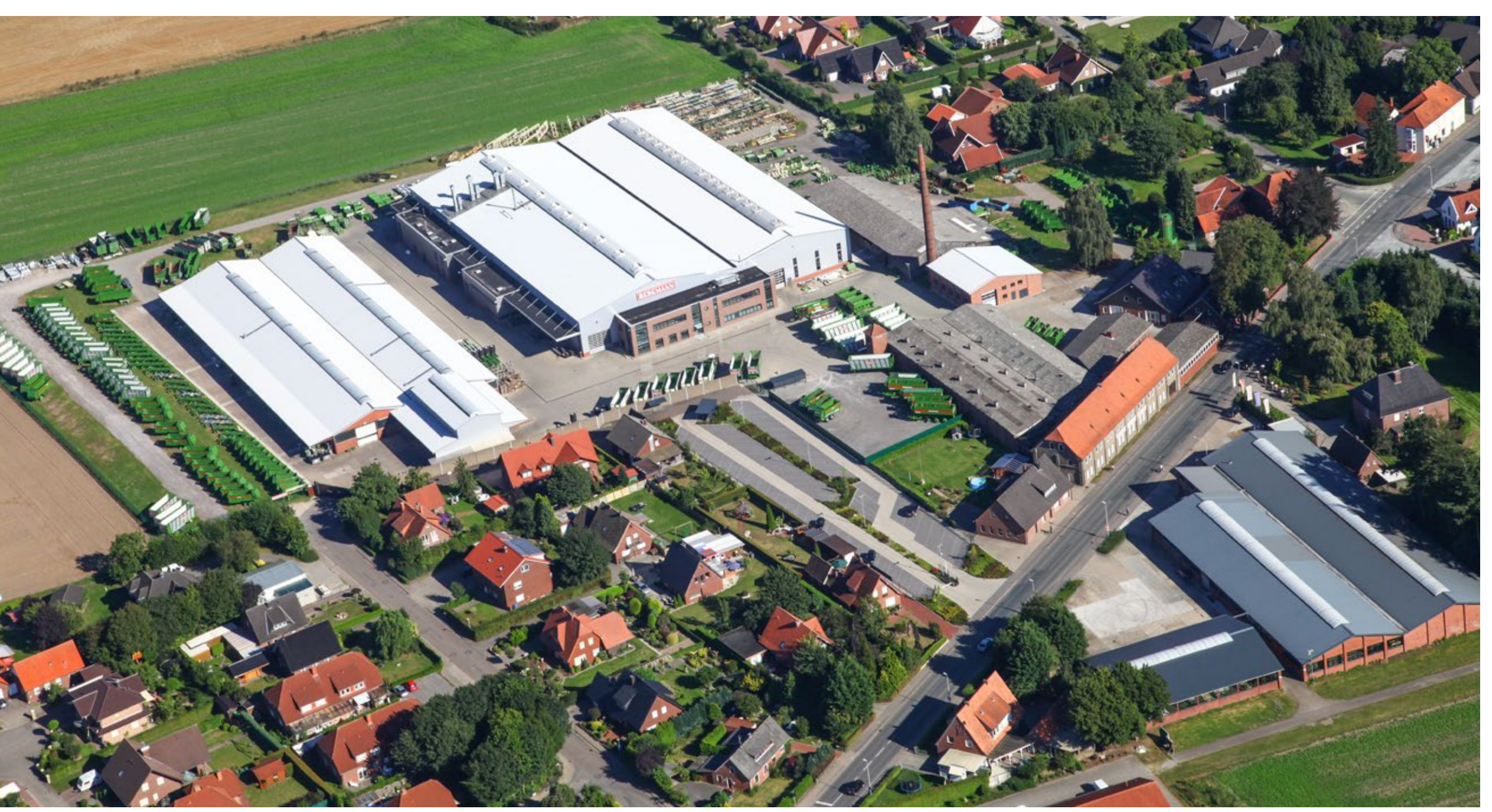
Proven quality: "Made in Goldenstedt"